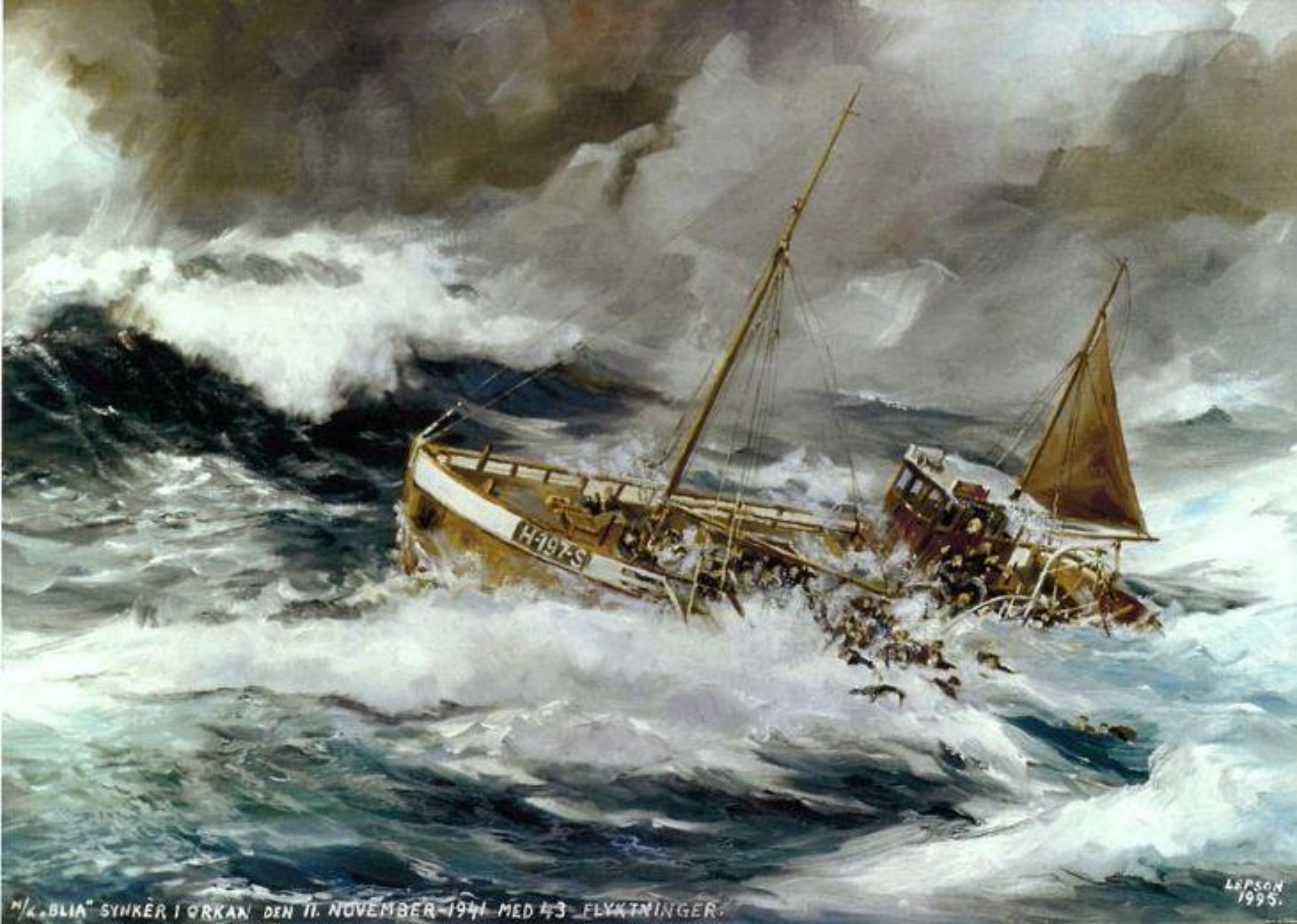
"M/K. BLIA" SYNKER I ØRKAN DEN 11. NOVEMBER 1941 MED 43 FLYKTNINGER.